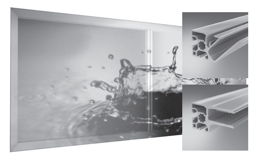
Main body profile 85-2N-JR