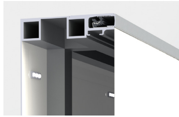
Retrofit JP (Building depth 67 mm)