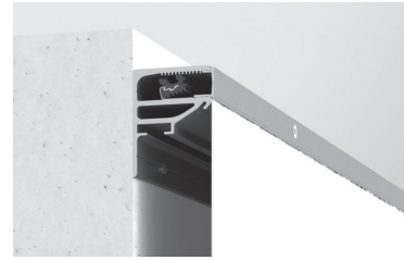
Front opening wallmounted (Building depth 50 mm)

EPS.LUMI GRIP is particularly suitable for applications in areas that are difficult to access or for special applications such as niches or illuminated ceilings.